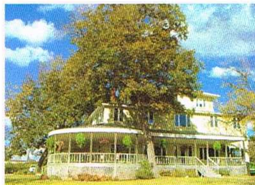
Last month the Haven looked beautiful all dolled up for a wedding...